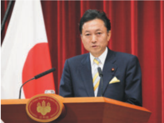
Mr. Yukio HATOYAMA, Prime Minister of Japan

Mr. Yukio HATOYAMA, a member of the House of Representatives, was designated as the next Prime Minister of Japan on September 16, 2009. Prime Minister Hatoyama became the 93rd Prime Minister (the 60th person to assume the