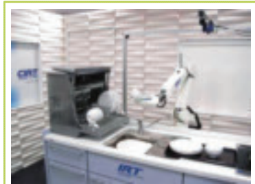
The Kitchen Robot.

When mopping the floor, meanwhile, the robot deftly moved a dining room chair with its right hand while using its left to mop under the table. Thereafter it resumed using both its hands to mop the areas free of furniture.