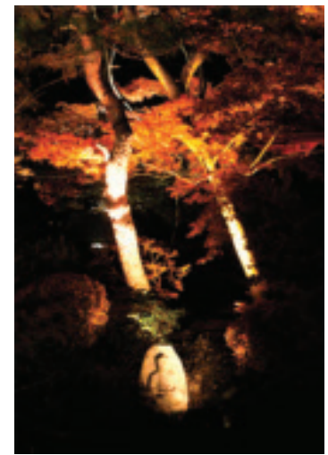
A lighted-up Maple Tree

It is not just the outskirts of the cities that abound with the beauty of Autumn, even within the cities special avenues are planted with maple trees and people walk along them not just in leisure time but also during daily commuting to work, thus making it a part of daily life. Recently, the maple trees and avenues are lit up with light at night, thus making it possible to enjoy the autumn beauty not just during daytime but also at night. Youngsters and working people often go to parks and close by temples to enjoy the night time maple avenues. In late autumn, when these colored leaves start falling, the entire floor starts appearing like a maple leaf carpet with yellow, orange and red colors.