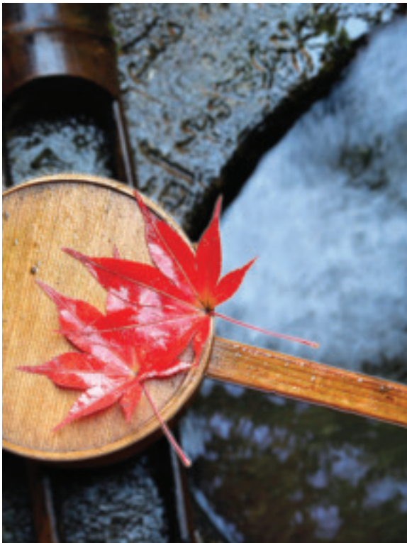
View of the Maple from Shrine Gate

The second possibility that came to my mind was during the Obon festival, when the entire atmosphere is charged and lots of activities like beautiful fire works, dancing, bazaars, etc. take place... Suddenly I hit across a picture, and seeing it instinctively and without a delay of a second I decided that autumn is the time when my parents would visit Japan.