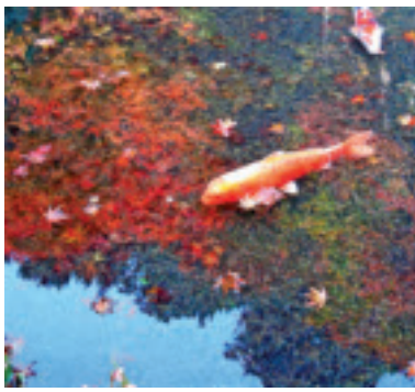
Reflection of the Maple in Pond

plexes along the outskirts of the main city, which are critically located on the mountain tops and along axial viewpoints, and are beautifully integrated with the nature around. These temple complexes are no doubt masterpieces of architecture; however, visiting them in autumn with the colored natural background enhances its beauty manifold. It's not just tourists but also the local people that go to these temples and shrines to enjoy the sublime beauty of nature and architecture. In Japanese language, the act of going to see these colored leaves is called 'momiji gari suru' which is a very interesting term and literally means going on a pleasure trip to hunt for the colored leaves. Sitting in a tea house in the temple and drinking Japanese tea is a life time experience. The view of the beautiful Zen garden of the tea house with stark white stone gravels with simple raked wave patterns on it; the water pond beside it reflects the beautiful colors of the sky and the maple trees above it, which are a total contrast of material, color and texture. However, these together synthesize with the pin-drop silence, to give birth to a sublime form of beauty which has to be felt and experienced.