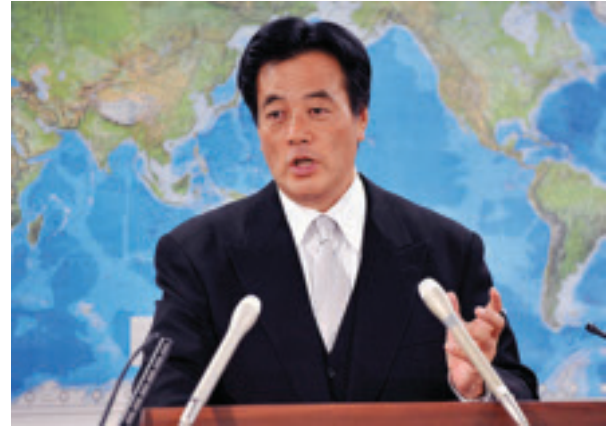
Mr. Katsuya OKADA, Minister for Foreign Affairs of Japan

Mr. Yukio HATOYAMA, a member of the House of Representatives, was designated as the next Prime Minister of Japan on September 16, 2009. Prime Minister Hatoyama became the 93rd Prime Minister (the 60th person to assume the