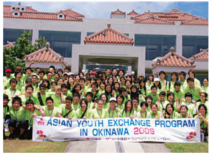
Group photograph - Asian Youth Exchange Program in Okinawa 2009

On the 22 nd and 23 rd , we had the Open Seminar, organized in the local government hall, which students from Okinawan schools attended as well. There were many inspiring lectures, but perhaps the most interesting of them all was the lecture by Mr. Mamoru Mori, ex-astronaut and scientist. He talked about science and how it connects all of us, and also showed us some very interesting live experiments. He epitomizes the spirit