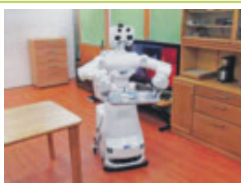
The Home Assistant Robot.

Researchers at the University of Tokyo are integrating information technology and robotics to develop robots that can perform household chores. Their work on the Information and Robot Technology Research Initiative, or IRT, has already resulted in