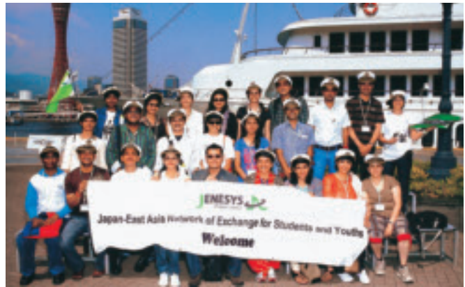
The author with other participants of the JENESYS Program

Sharing time with the host family, with the JICE coordinators, with the students of the Mukogawa University, with random people on the metro, shops and streets, provided great personal insight; in that, I came to realize how futile it was to try and seek to understand that which is constantly changing and unique. Every individual and location was distinctive, and ascribing them a common expression would be to undermine their imitability.