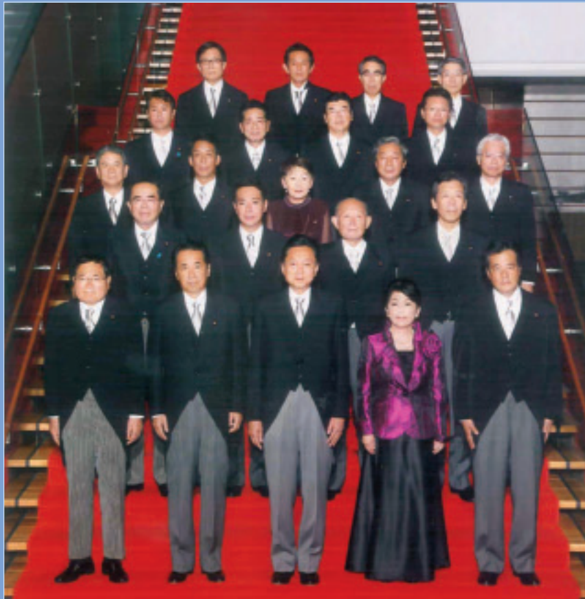
Prime Minister of Japan and his Cabinet (inaugurated on 16 September 2009)